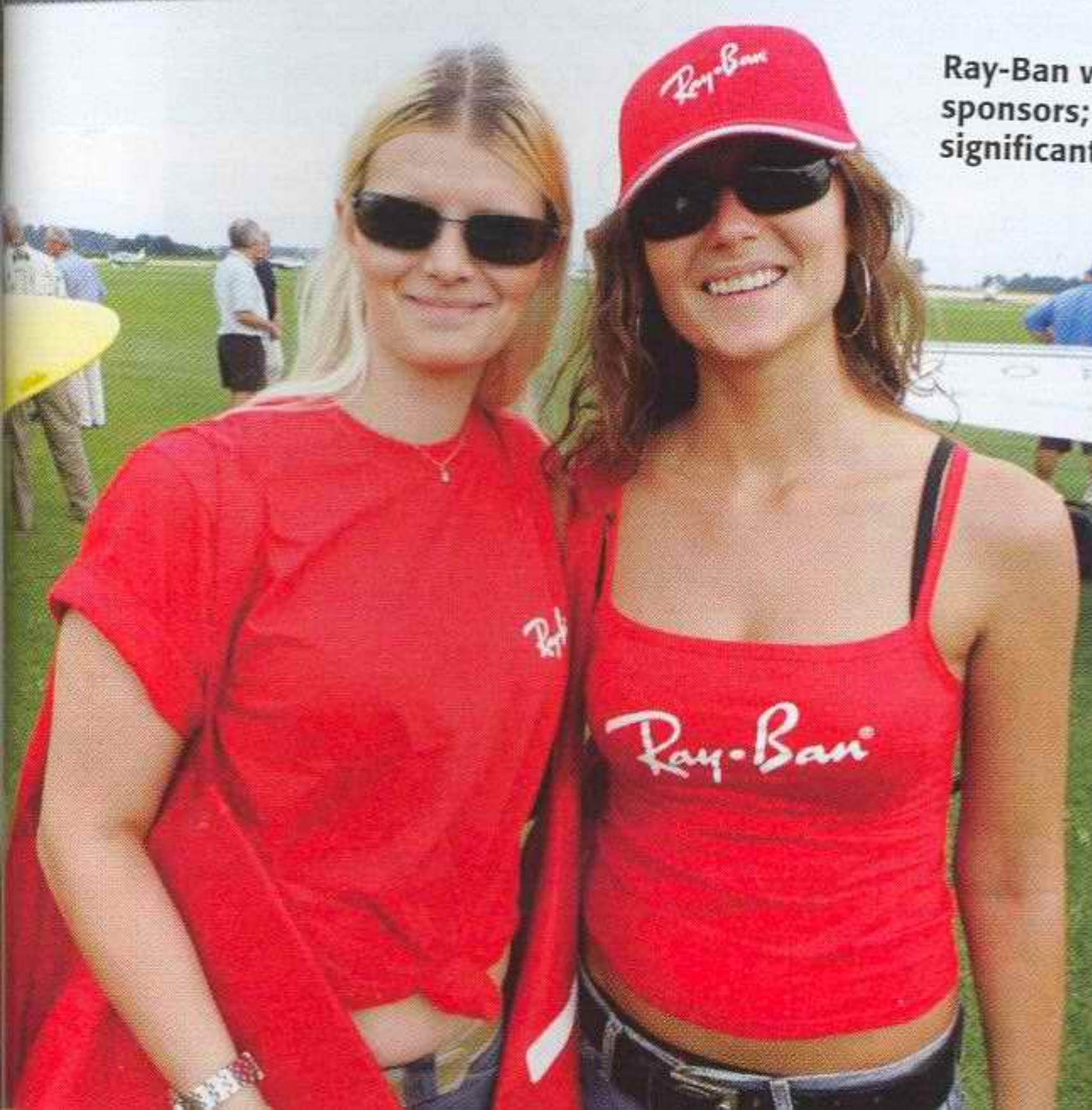
Ray-Ban were one of the event sponsors; all of whom added significantly to the event