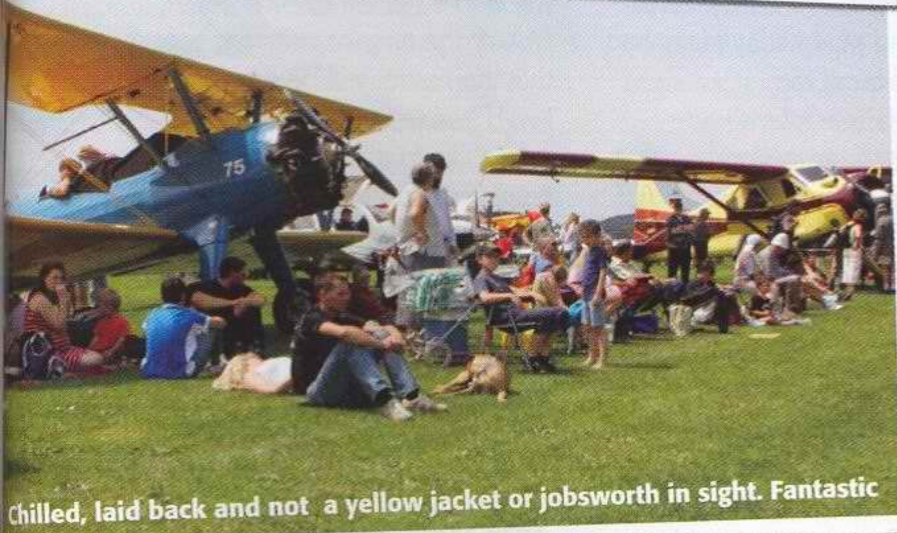
Chilled, laid back and not a yellow jacket or jobsworth in sight. Fantastic