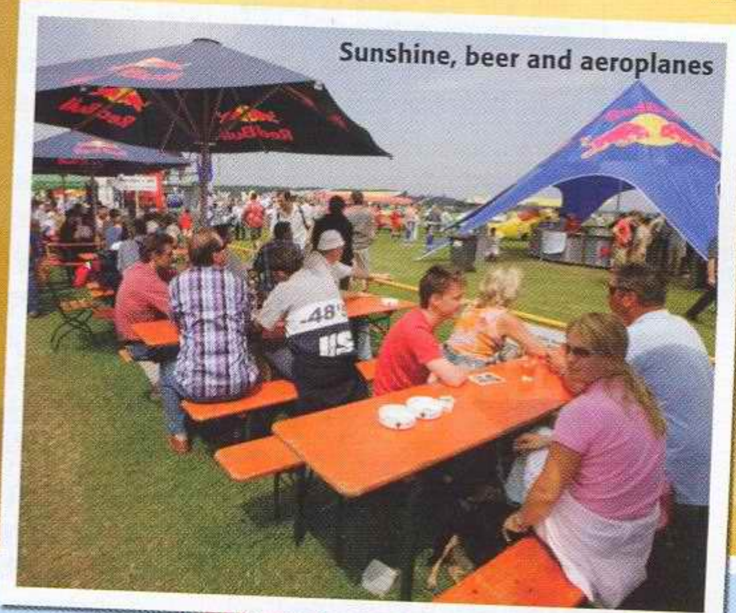
Sunshine, beer and aeroplanes