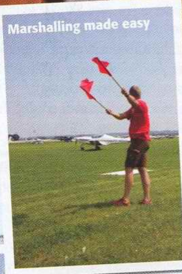
Marshalling made easy