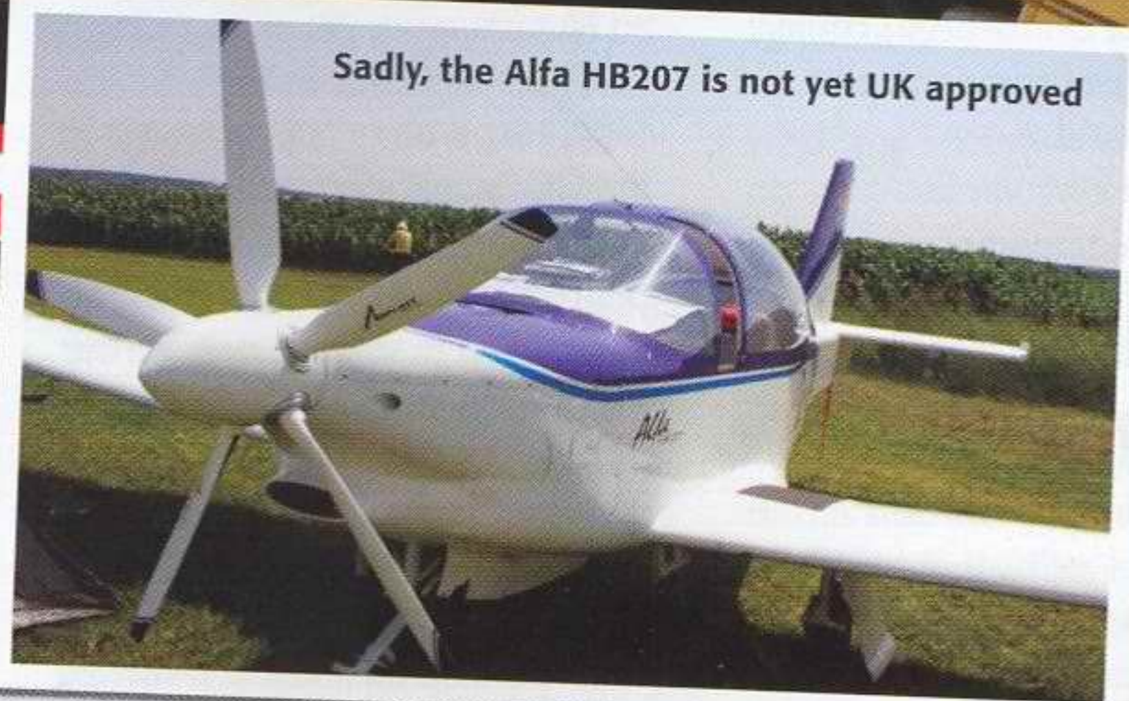
Sadly, the Alfa HB207 is not yet UK approved